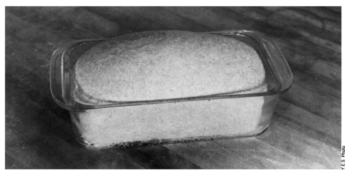
Only a small amount of leaven is required to make bread dough rise and puff up.

festival pictures the second step in God's plan. It is a special reminder for God's people to carefully examine their lives, put sin out, and strive to obey God's commandments.