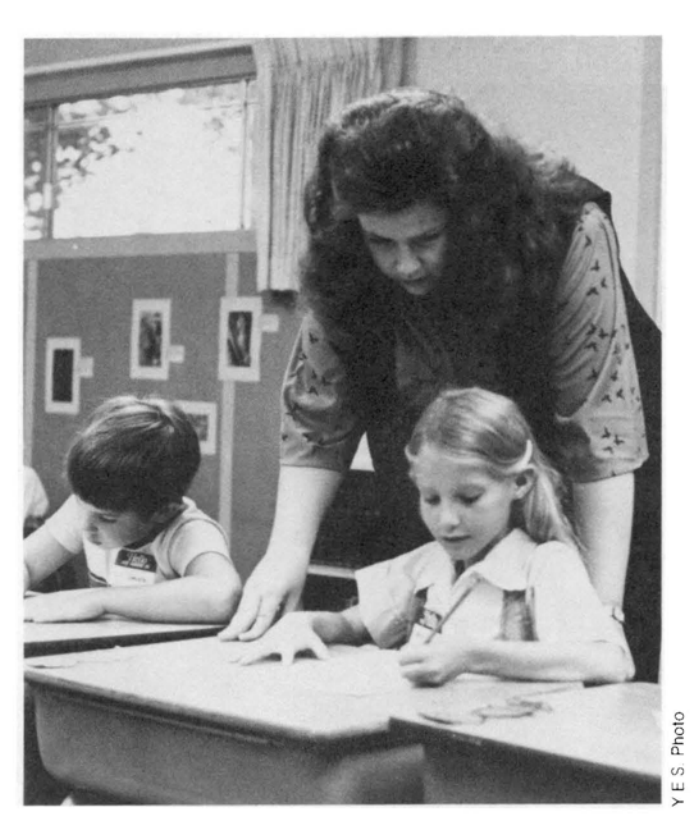
Members of God's Church are the "firstfruits" being trained to become teachers in the World Tomorrow.